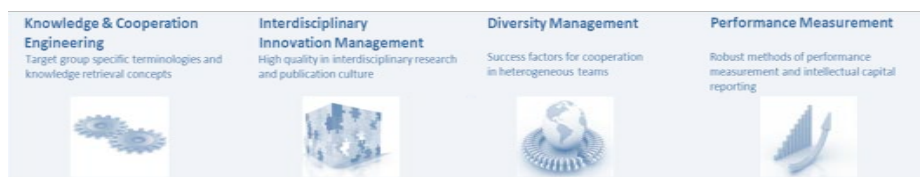
Fig. 1. Sections of scientific cooperation engineering in the cluster of excellence

Thus the overall objective of scientific cooperation engineering is to set up sustainable personnel and organizational structures for scientific cooperation leading to the super-ordinated research question [1]: Which actions are necessary to support the transfer of highly complex, dynamic and interdisciplinary research cooperation of the cluster of excellence into sustainable and robust structures?(cf. Fig. 1).